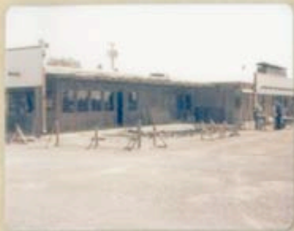
1980 - The first of many expansions are started. This one involved the front entrance as well as the lobby area.