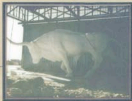
1970's - Front Beach Road is four lanes and out of concern for lack of traffic, a giant steer is erected to grab attention of passers by. After a "Name the Steer" contest is finished, the winning name is awarded and "Big One" comes to life.