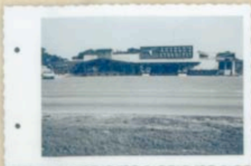
1958 - Angelo Butchikas moves to the beach and opens his own restaurant "Angelo's Steak Pit." It is located where it stands today on Front Beach Road and was previously the old "94" club.