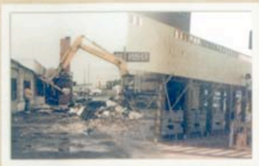
1990's - The second expansion is done to create a larger "Steak Pit" and service area as well as more seating capacity.