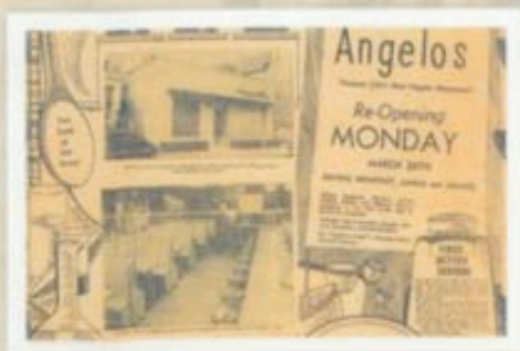
1954 - The first Angelos is opened, located beside the old Southern Bell Company building in the downtown area. Receiving a warm welcome from the community as well as rave reviews.