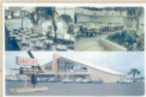
1990's - Angelos "By the Sea" opens. It is located on West Beach Drive and also has deck side parking. Angelo Butchikas was the building designer, proprietor and was way ahead of his time.